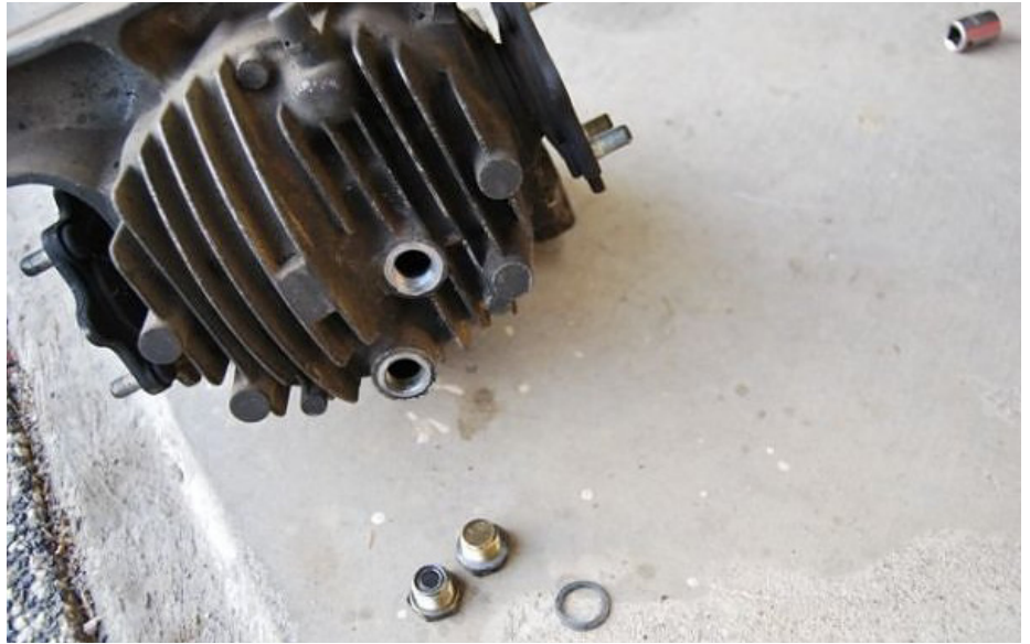
10/11. Putting it all back

From here you simply re-attach the half shafts and the tail shaft and fit all the nuts and bolts. Installation is the reverse of removal. (I have developed a habit with my car, after having numerous issues with seized bolts, that everything I take apart gets put back together with a good coating of copper grease. Works wonders.)