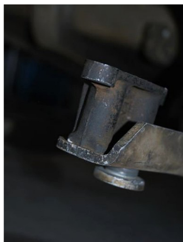
8. Remove the spacer in the PPF