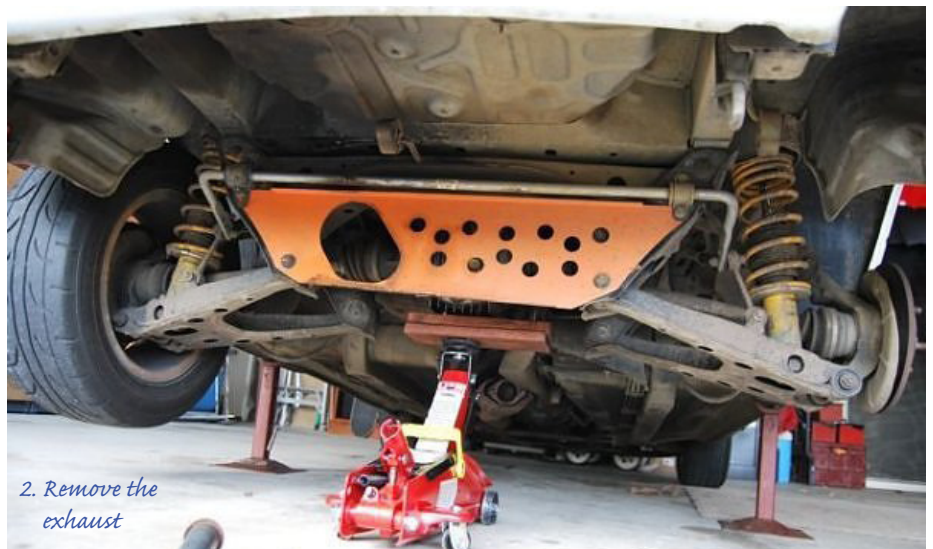
2. Remove the exhaust