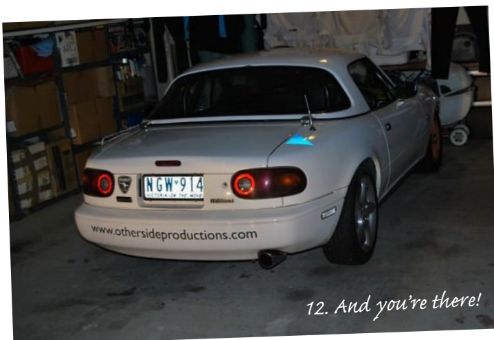
12. And you're there!

Then you are ready to remove the axle stands and take the car for a test drive. ■