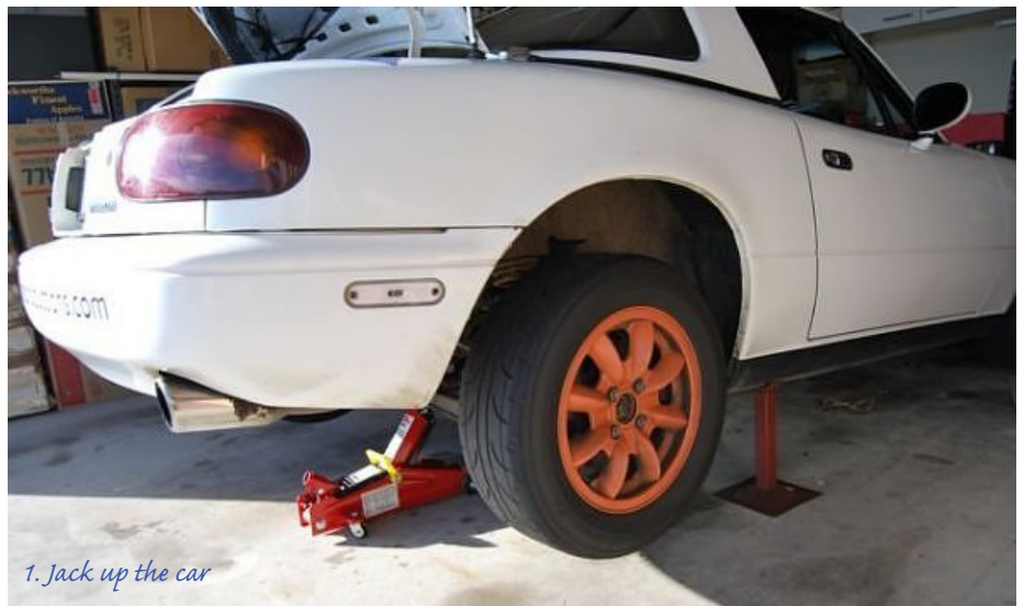
1. Jack up the car

3. Start the epic un-bolting process. There are four bolts connecting the diff and tail shaft on each side and another four connecting the half shafts. You have to have the handbrake engaged to loosen the half shaft nuts. You can't access all of them at once so you have to take the handbrake off to rotate the shaft to allow access to the other nuts. Similarly to undo the tail shaft nuts you have to have the car in gear, but to access all of them you have to put the car into neutral to rotate the shaft. Having a second person saves