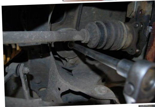
6. Remove the diff cradle bolts