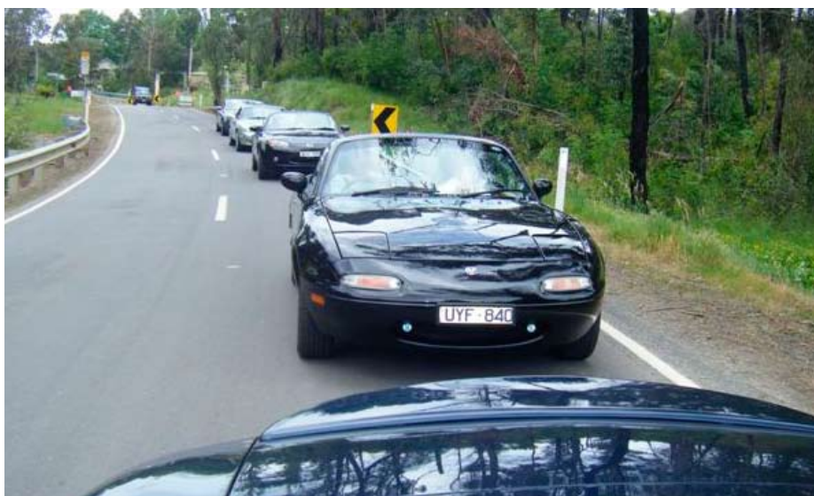
Blue Maxx's first Club run

To fill in the time waiting for the bits we adjourned to Tassie for Christmas. We had a great time – boating, a bit of fishing, a lot of drinking, socialising with all the rellos, golf at the Murraville golf