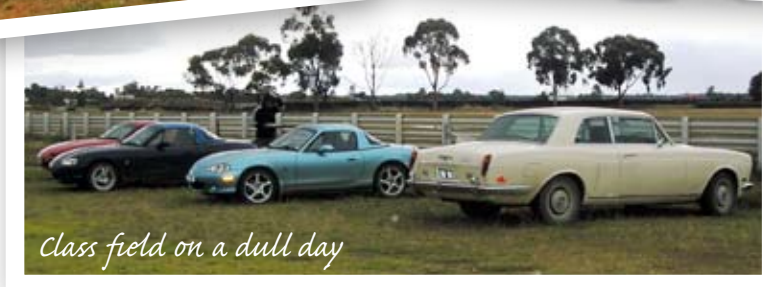
Class field on a dull day