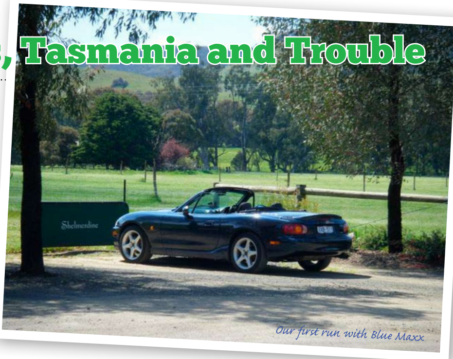
Our first run with Blue Maxx

A week later the car was ready. After some debate Debbie and I decided to take the train from Sunbury to Echuca. We had a very comfortable trip to Bendigo, then swapped to a coach which runs more-or-less parallel with the train line for the last leg to Echuca. Someone will know